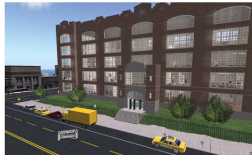
Image 1 The school building

The school and Environment were modeled on a real school building and surrounding area in Brooklyn, as shown in image 1. Providing a backdrop and content for the learner to relate to. Many schools and public buildings across America are deemed Emergency Centers in case of an emergency and by providing such an environment for this simulation it provided a sense of realism and grounding.