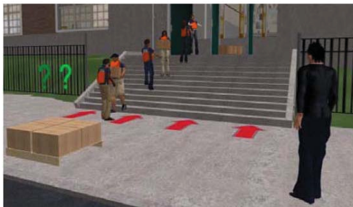
Image 2 An example animation

Animations are found throughout the simulation – these are specific animations triggered when the user accomplishes an exercise. They see the result of their action played out in the 3D world. These animations are developed in-world and triggered via PIVOTE, an example of an animation can be seen in image 2. After the learner has answered a question regarding