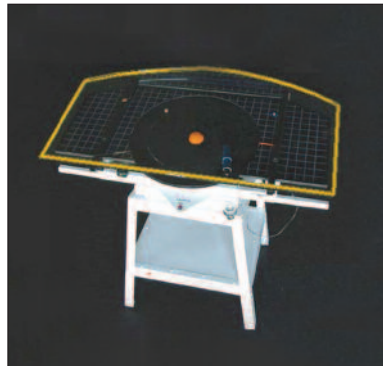
Figure 1. Gravity Assist Mechanical Simulator: Yellow outlines the glass surface that represents the ecliptic plane.

A manually spun wheel with high angular mass and low-friction bearings supplies momentum to an attached spherical neodymium magnet that represents a planet orbiting the Sun. A steel bearing ball following a trajectory across a glass plate above the wheel and magnet undergoes an elastic collision with the revolving magnet, illustrating the gravi-