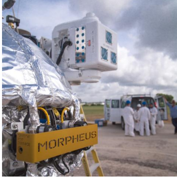
Figure 2 – ALHAT Hazard Detection System mounted on the Morpheus 'Bravo' vehicle

ALHAT is using an onboard laser altimeter and flash Light Detection and Ranging (LIDAR) for the onboard sensors to perform Terrain Relative Navigation (TRN) and Hazard Relative Navigation (HRN). A flash LIDAR flashes a very quick laser beam over a planetary surface area of approximately 100 x 100 meters. This cross-cutting technology is also being employed by commercial ISS supply companies and NASA's Orion project for automated rendezvous and docking (AR&D). The photons emitted from the LIDAR strike the surface of the target object or surface and return to a timing detector grid, giving very precise range and bearing measurements for each photon 30 times a second. These three dimensional measurements provide elevation information for each small segment of the surface, thus producing a digital elevation map that can be used to determine hazards to the landing vehicle. Software algorithms interpret this information and