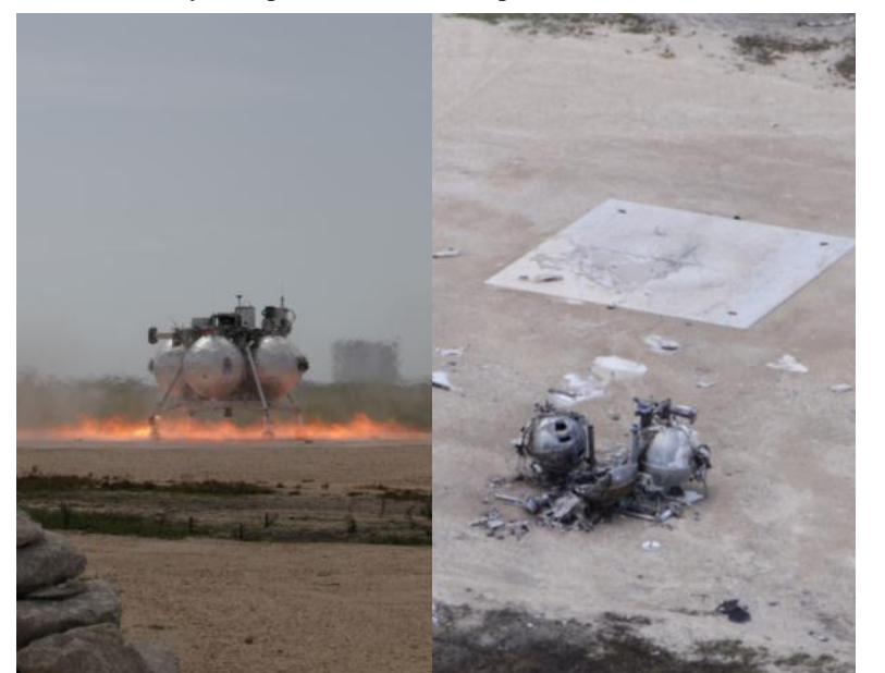
Figure 9 – Shuttle Landing Facility at KSC: Morpheus Free Flight 1at ignition; and Free Flight 2 after it crash landed.

With ALHAT integration testing complete, the team prepared for free flight testing by conducting one final tether test at JSC, shipping the vehicle to KSC, and then conducting a tether test at KSC's Shuttle Landing Facility (SLF) to verify transportation did not impact vehicle readiness.