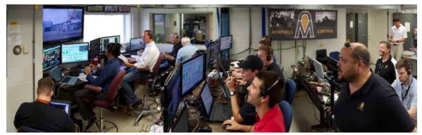
Figure 4 – Morpheus Control Center

The final element of the Morpheus system is Operations. Nine primary operator positions are staffed by team members: test conductor (TC), operator (OPS), propulsion (PROP), avionics, power and software (APS), guidance, navigation and control (GNC), ground control (GC), two range safety officers (RSO-1 and RSO-2), and the flight manager (FM). During tests with payloads aboard, another position may be included, such as one for ALHAT. Each position is certified through specific training.