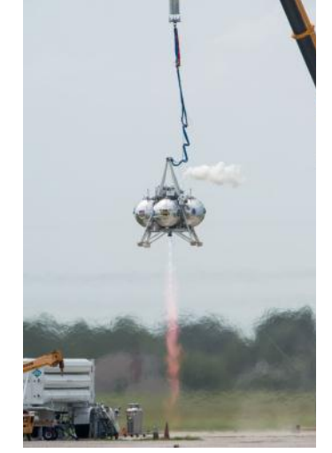
Figure 7 – Morpheus 1.5 'Bravo' executing a Tether Test in July 2013

actuators under load. The majority of engine characterization is