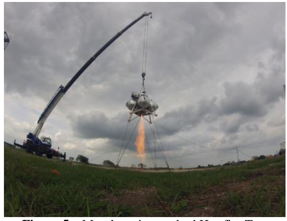
Figure 5 – Morpheus in standard Hot-fire Test Configuration

Due to the potential dynamic loads during tethered flight, a substantially