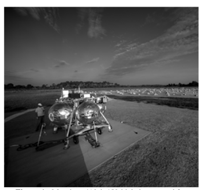
Figure 1 - Morpheus 'Alpha' Vehicle is prepared for testing at Kennedy Space Center in August 2012.

The Morpheus Project provides a liquid oxygen (LOX) / liquid methane (LCH4) propelled vehicle that, when leveraging subsystem designs developed by other VTBs such as the Marshall Space Flight Center's (MSFC) Mighty Eagle Lander, may be developed into reusable platforms for in-space transit and/or planetary landing for multiple missions and payload capacities. Such platforms could directly support robotic missions and would eventually mature into capabilities advantageous for manned missions.