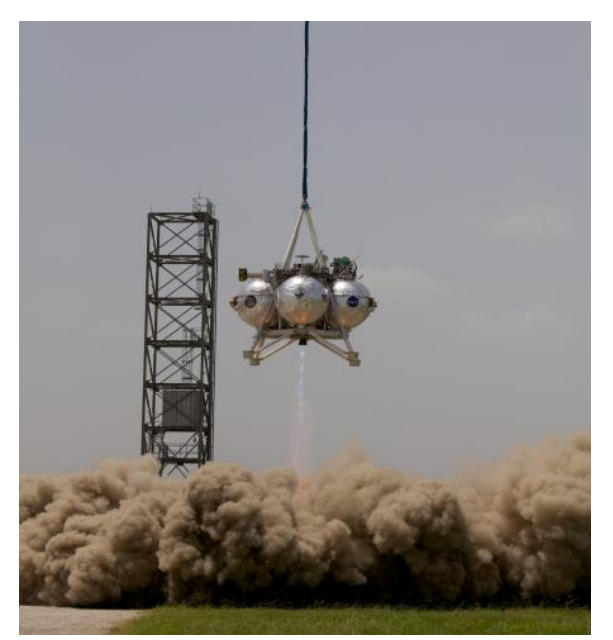
Figure 10 – Morpheus 1.5 'Bravo' executing a translational Tether Test in August 2013. Mars soil simulant was deployed on the launch pad to study plume impingement for the Mars 2020 program.

The knowledge gained in testing the 'Alpha' vehicle significantly improved the performance characterization of the 'Bravo' vehicle once its testing began. However, there were a number of sticking points that needed attention. For one, 'Bravo' is a 200lb heavier vehicle and its engine produces 800lb more thrust than its predecessor. The change in mass properties, combined with some plumbing changes, led to an unacceptable susceptibility to propellant imbalances that caused a number of soft aborts during early tether testing. The abort box is a very stringent 4m for tether testing, to prevent tether interaction and ensure crane protection. Tuning of guidance and