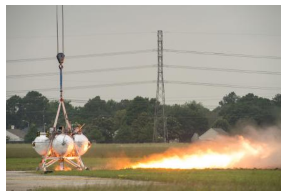
Figure 6 – Morpheus in Ground Hot-fire Test Configuration

Figure 5 shows the vehicle during test in the hot-fire configuration. The vehicle is suspended approximately 20' above a concrete pad by a crane outfitted with