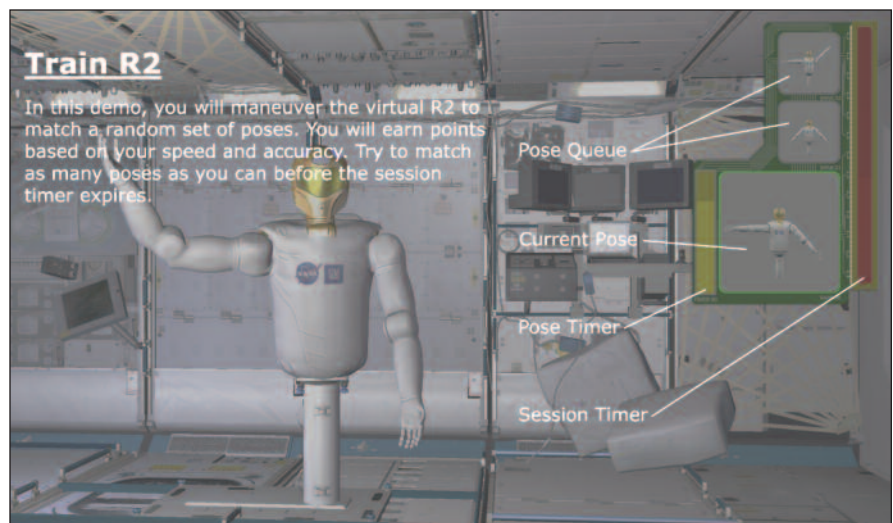
Figure 2. In Train R2, the student learns to control a simulated R2 using simple poses.