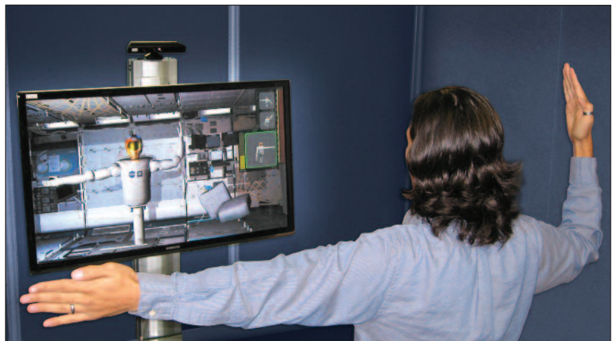
Figure 1. The Xbox 360 is one of the most recognized gaming consoles.

Users can "fly through" the ISS using their body, allowing an experience similar to what an astronaut would have on orbit. In PlaySpace, users can fly over the surface of Mars and view surface data obtained by Mars rovers. Users of Train R2