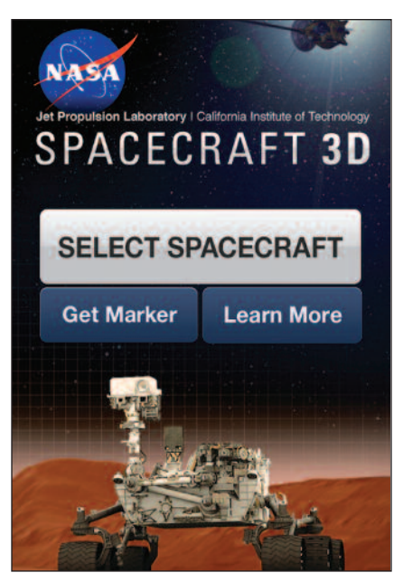
Spacecraft 3D Application allows one to interact and learn about different missions.

The software receives input from the mobile device's camera to recognize the presence of an AR marker in the camera's field of view. It then displays a 3D rendition of the selected spacecraft