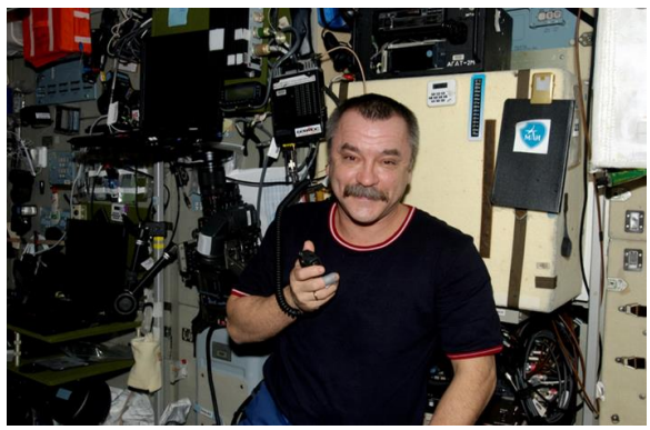
Fig 9: Russian cosmonaut Mikhail Tyurin during a communication session with MAI

The experiment uses a communication channel to the amateur radio frequencies, which can significantly increase the number of participants in Russia and around the world. The results of the experiment may be received while in the workplace, possible by having receiving-transmitting equipment, amateur radio frequency bands VHF.