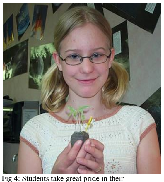
Tomatosphere plants, which they may keep at the end of the experiment. Many classrooms report that their students make "space salsa" from the fruits of their labour.

Since 2001, an estimated three million students in Canada and the United States have participated in the award-winning Tomatosphere educational project. Tomatosphere fosters student learning about science, space exploration, agriculture and nutrition by giving them hands-on experience with research methodology. The project's hands-on baseline experiment investigates the germination rate of the seeds by providing students with two sets of tomato seeds: one set that has been exposed to space or space-simulated environments, as well as a control group for comparison. Without knowing which set is which, students grow the seedlings in their classrooms, measuring a variety of information about the tomato plants, the germination rates, growth patterns and vigor of the seeds. Each class submits their results to the project's website to be shared with scientists studying horticulture and environmental biology. The blind-study methodology enhances the mystery of the project for each classroom, and adds to the excitement of participating in a real science experiment.