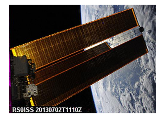
Fig 11: Sample of image taken from the ISS RS by amateur radio communication channel during the sessions SE "MAI-75."

Using information from space in the educational process of secondary and higher education system would improve the effectiveness of teaching natural science disciplines cycle, as well as to provide additional public awareness of the status of implementation of space programs.