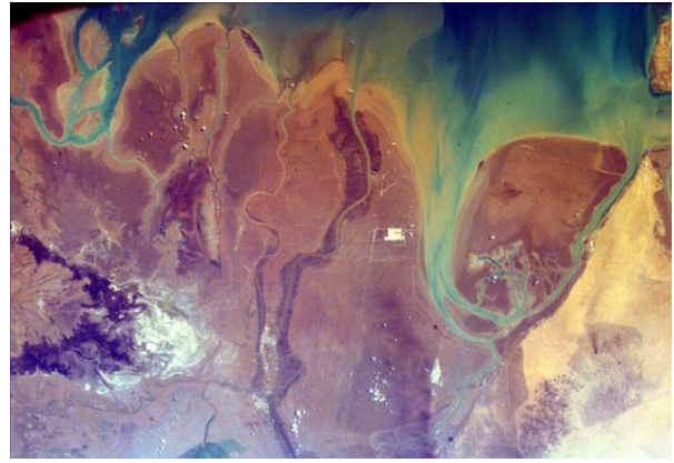
Fig 13: This image from NASA's EarthKAM is of the northern end of the Persian Gulf and the broad delta complex of the Tigris, Euphrates, Shatt al Arab, and Karun rivers has captured the arid-looking wetlands of northeast Kuwait (Bubiyan Island)

were taken by middle school students across the US are shown in Figures 13 and 14.