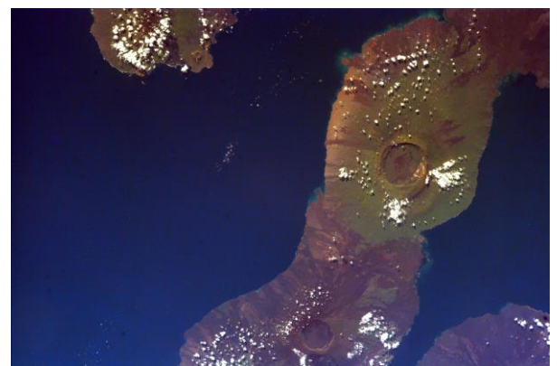
Fig 14: This image of the Galapagos Islands captures two large shield volcanoes on Isla Isabella, the largest and least inhabited island in the Galapagos chain. This image is from NASA's EarthKAM.