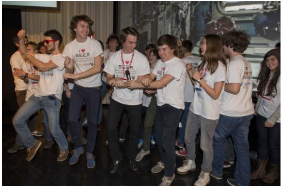
Fig 3: Alliance of German and Italian students (Brotherhood of Esteemed European Researchers) celebrate winning the ESA finals of the 2012 competition during the live connection with the ISS

A key phase in the competition introduced in 2011, when ESA participated for the first time, was the introduction of alliance formation. The alliance of three teams from different states (US) or countries (ESA member states) introduced the students to added complexity of communicating over different time zones, in some cases in different languages, with peers they had never met before.