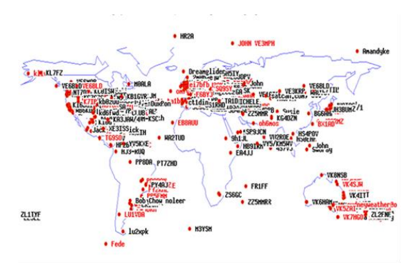
Fig 10: Centers of data reception from the ISS RS during "MAI-75" experiment sessions.

enable education program participants to work directly with the general-purpose video equipment deployed on the ISS. Using a Web interface and a special site, the program participants are able to control a digital camera installed on the ISS RS, based on both the Web-posted camera operation schedules and the ISS sub-satellite point movement data.