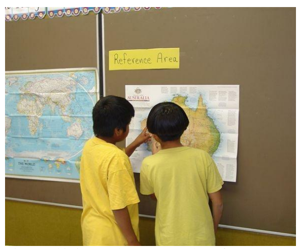
Fig 12: This image shows two students from Sacaton, Arizona who participated in the Sally Ride EarthKam project for three missions. The students are locating areas on a map that were captured by the EarthKAM camera.

One of the longest running investigations on the ISS to target students is an educational project developed by Dr. Sally Ride, the first American woman in space. The Sally Ride EarthKAM (Earth Knowledge Acquired by Middle School Students) has been in operation since Expedition 2 in 2001.