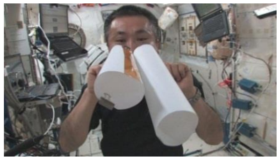
Fig 8: "Bernoulli's principle (Malaysia)" experiment conducted by Koichi Wakata

A total of 18 experiments have been conducted to date. Participating countries set high valuations on the program because this program can develop an interest in science for young students and a sense of participation in space activities for the people of Asian countries. Considering to the requests by Asian countries, this program has to be continued and also be improved to extend a broader range of people.