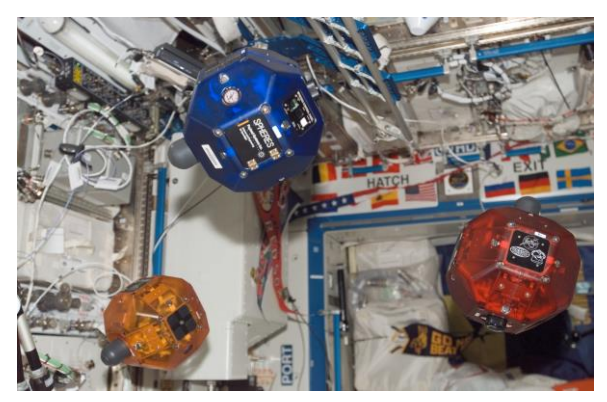
Fig 1: There are three SPHERES on the ISS, two of which are used for ZR

Since 2009, Massachusetts Institute of Technology Space Systems Laboratory (MIT SSL) has given access to their research facilities SPHERES on board the ISS under the guise of a competitive game designed for High School students called Zero Robotics (ZR). SPHERES are autonomous freefloating volleyball sized satellites on the ISS (figure 1).