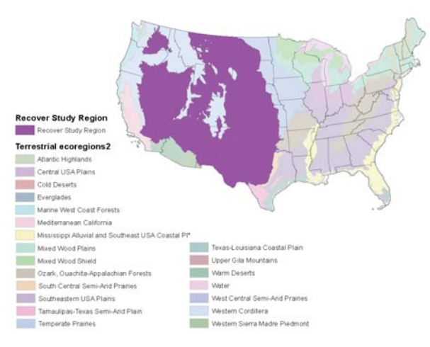
Figure 1. Savanna ecosystem to be served by the RECOVER system.

The current process of preparing a fire rehabilitation plan typically begins with the BAER team leader requesting a fire severity product. A difference normalized burn ratio (dNBR) layer derived from Landsat imagery is generally the product that is delivered (Cocke, et al., 2005; Key and Benson, 1999). This product may be integrated with other data, such as topographic information, soil properties, land use, presence of threatened or endangered species, threats to life and property, historic and recent conditions of soil moisture, to create the knowledge base upon which a remediation plan is crafted.