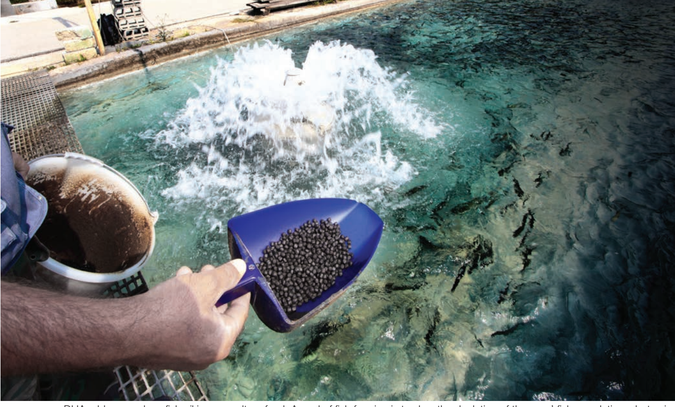
DHAgold can replace fish oil in aquaculture feed. A goal of fish farming is to slow the depletion of the seas' fish populations, but using fish oil in the feed undermines that aim.

complications, such as Alzheimer's disease, attention deficit disorder, and depression.