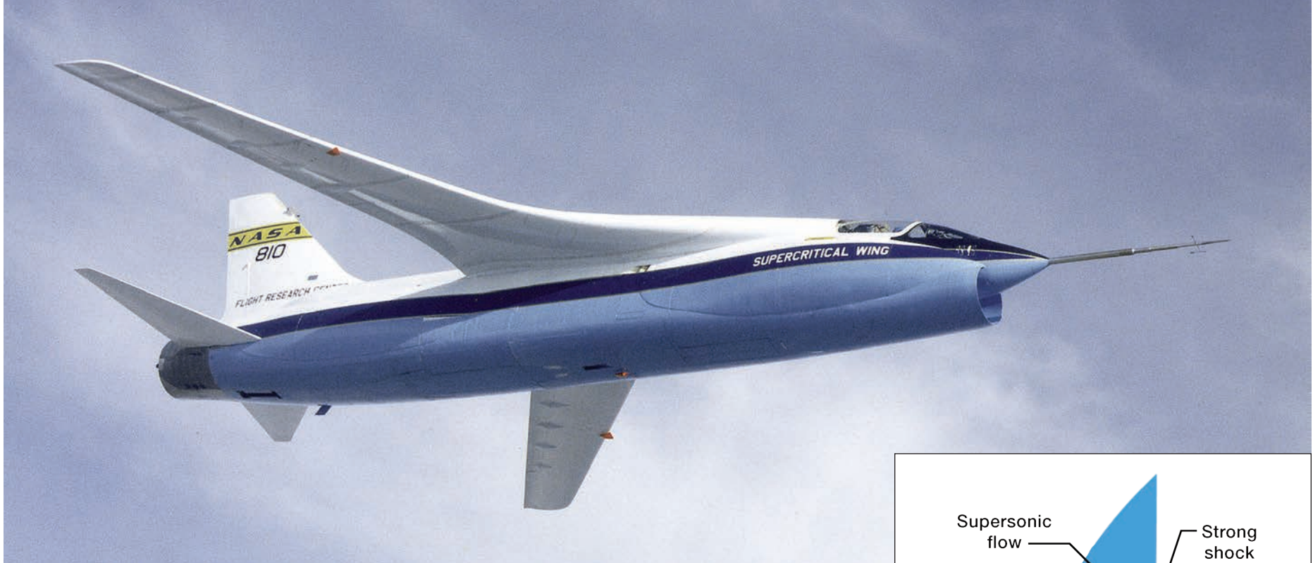
The first aircraft used to test supercritical wing designs was a modified Vought F-8 Crusader provided by the US Navy.

at double the speed of sound—he became frustrated and returned to the more familiar field of transonics, speeds at or around the speed of sound. His supervisor suggested he research wing characteristics for an aircraft design being studied by the Ling-Temco-Vought Company.