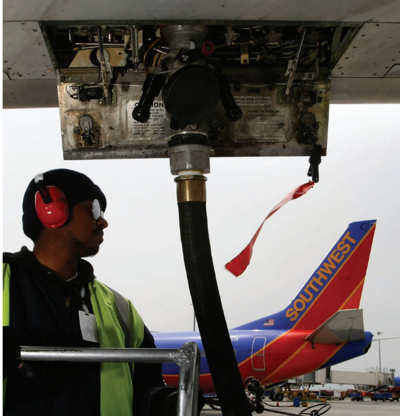
NASA-developed supercritical wings save the airline industry billions of dollars' worth of fuel every year, which also means significant reductions to greenhouse gas emissions.

What they ended up with almost looked upside-down compared with standard wings of the day, because it was nearly flat on top and rounded on the bottom. It was also thicker than the norm, especially on its blunt leading edge.