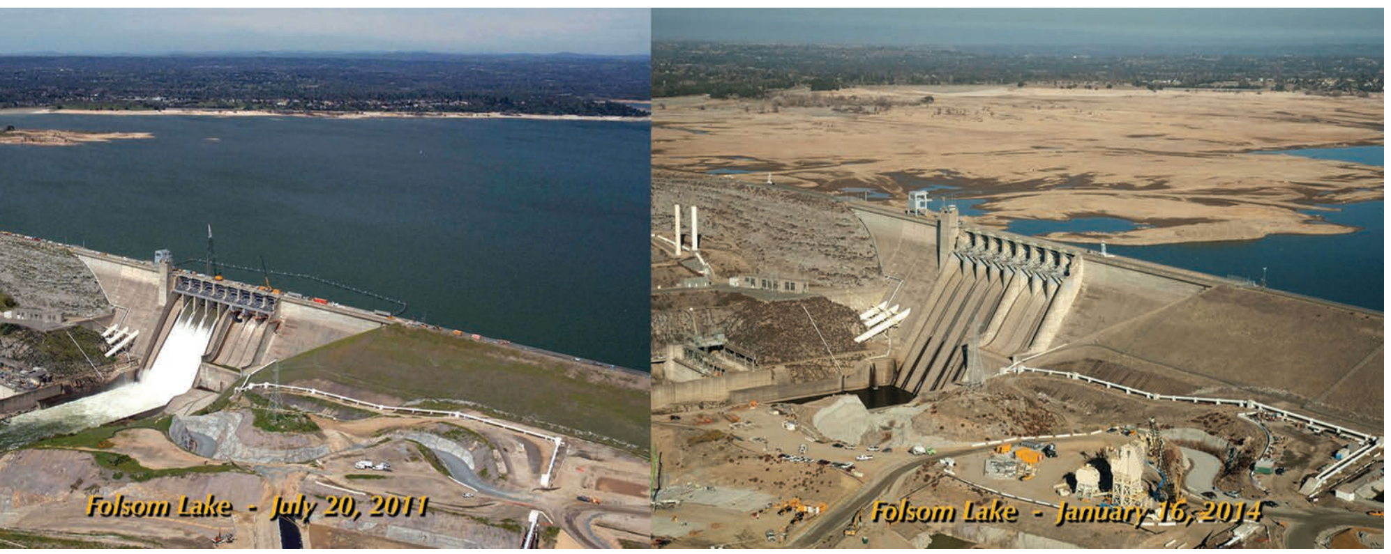
Folsom Lake, located at the base of the Sierra foothills in California, provides hydroelectricity and drinking water for Folsom City as well as irrigation water for the Central Valley. The before-and-after image of the lake shows the severity of the state's current drought.