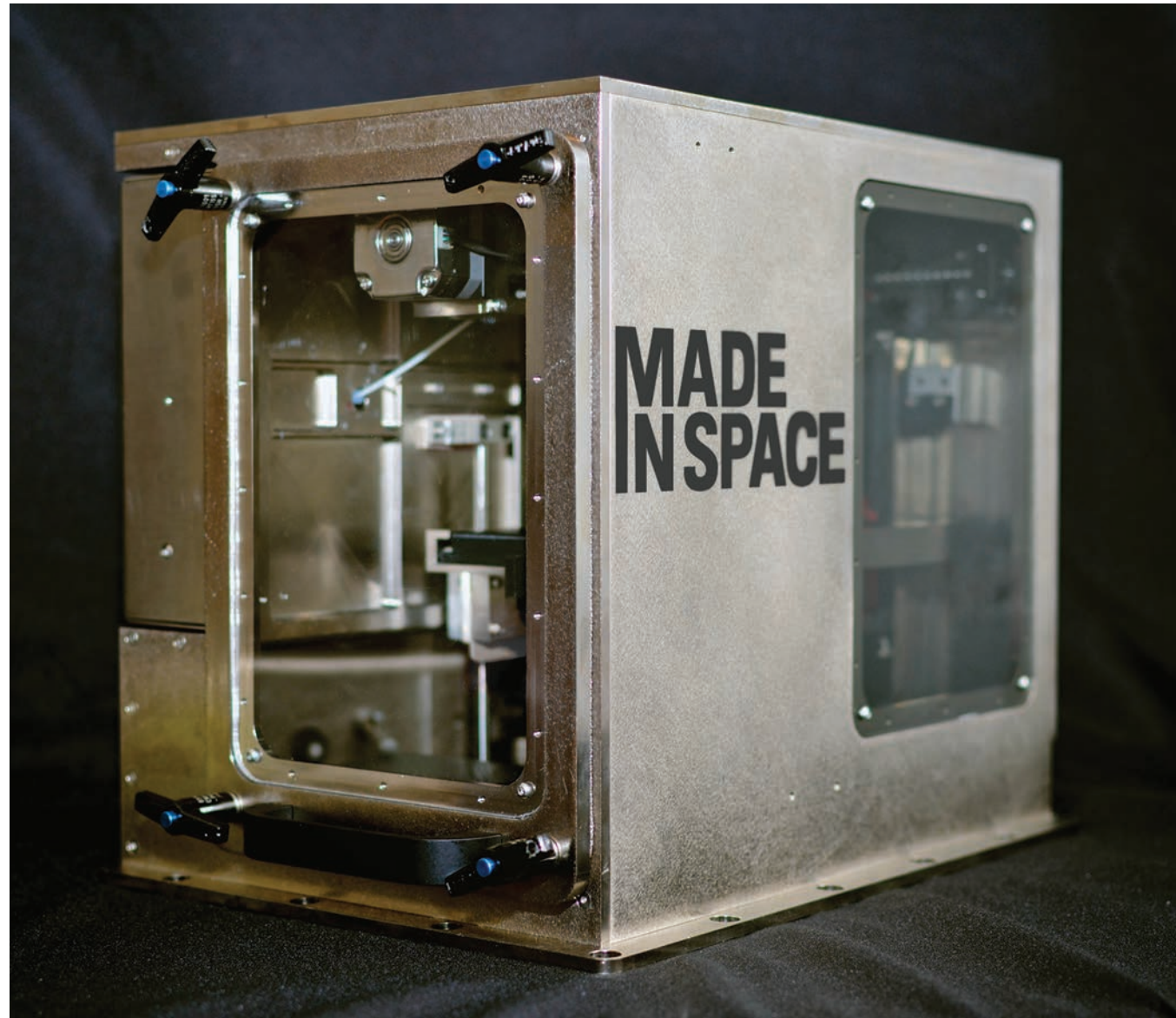
The prototype for a 3D printer capable of operating in microgravity, created by Made In Space with the help of a couple of Small Business Innovation Research contracts with NASA's Marshall Space Flight Center, is slightly smaller than the one the company will create for installation aboard the International Space Station.