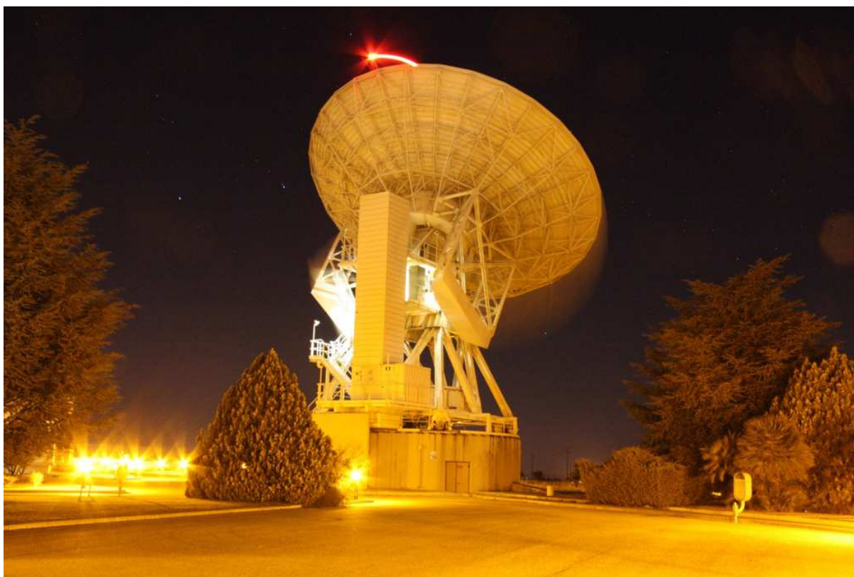
Figure 1. The Matera “Centro di Geodesia Spaziale” (CGS).

The Matera VLBI station is located at the Italian Space Agency’s ‘Centro di Geodesia Spaziale G. Colombo’ (CGS) near Matera, a small town in the south of Italy. The CGS came into operation in 1983 when the Satellite Laser Ranging SAO-1 System was installed at CGS. Fully integrated into the worldwide network, SAO-1 was in continuous operation from 1983 up to 2000, providing high precision ranging observations of several satellites. The new Matera Laser Ranging Observatory (MLRO), one of the most advanced Satellite and Lunar Laser Ranging facilities in the world, was installed in 2002 and replaced the old SLR system. CGS also hosted mobile SLR systems MTLRS (Holland/Germany) and TLRs-1 (NASA).