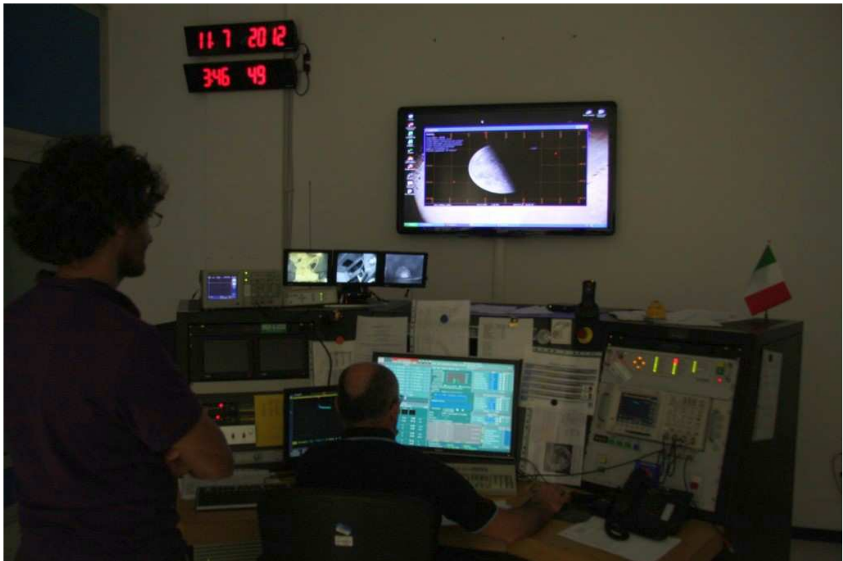
Figure 2. MLRO in action.

Thanks to the co-location of all precise positioning space based techniques (VLBI, SLR, LLR, and GPS) and the Absolute Gravimeter, CGS is one of the few “fundamental” stations in the world. With the objective of exploiting the maximum integration in the field of Earth observations, in the late 1980s ASI extended CGS’ involvement also to remote sensing activities for present and future missions (ERS-1, ERS-2, X-SAR/SIR-C, SRTM, ENVISAT, and COSMO-SkyMed).