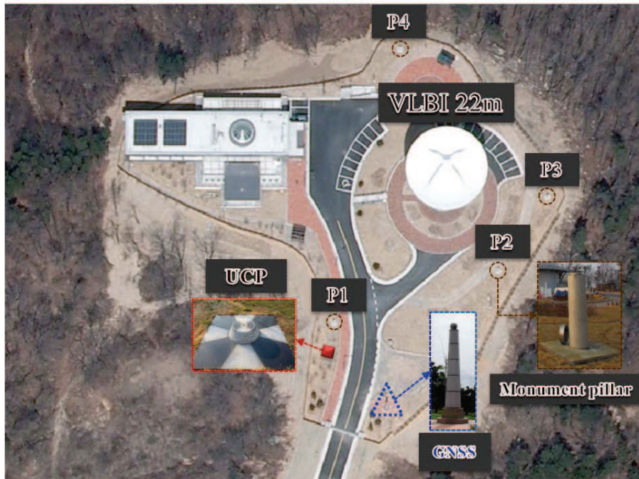
Figure 1. VLBI 22-m antenna, monument pillars 1 - 4, GNSS, and UCP (Unified Control Point) layout.

shape, and the 22-m main reflector consists of 200 rectangular aluminium panels. Each panel has four elevation adjustments at the edge of the panel, so that the antenna main reflector surface can be properly arranged.