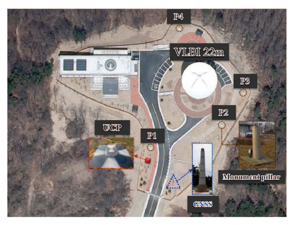
Figure 1. VLBI 22-m antenna, monument pillars 1 - 4, GNSS, and UCP (Unified Control Point) layout.

shape, and the 22-m main reflector consists of 200 rectangular aluminium panels. Each panel has four elevation adjustments at the edge of the panel, so that the antenna main reflector surface can be properly arranged.