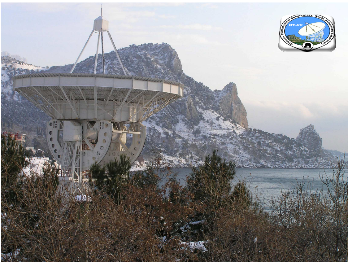
Figure 1. Simeiz VLBI station.

The Simeiz VLBI Station (also known as CRIMEA in the geodetic community), operated by Radio Astronomy Laboratory of Crimean Astrophysical Observatory, is situated on the coast of the Black Sea near the village Simeiz, 20 km west of the city Yalta in the Ukraine (Figure 1).