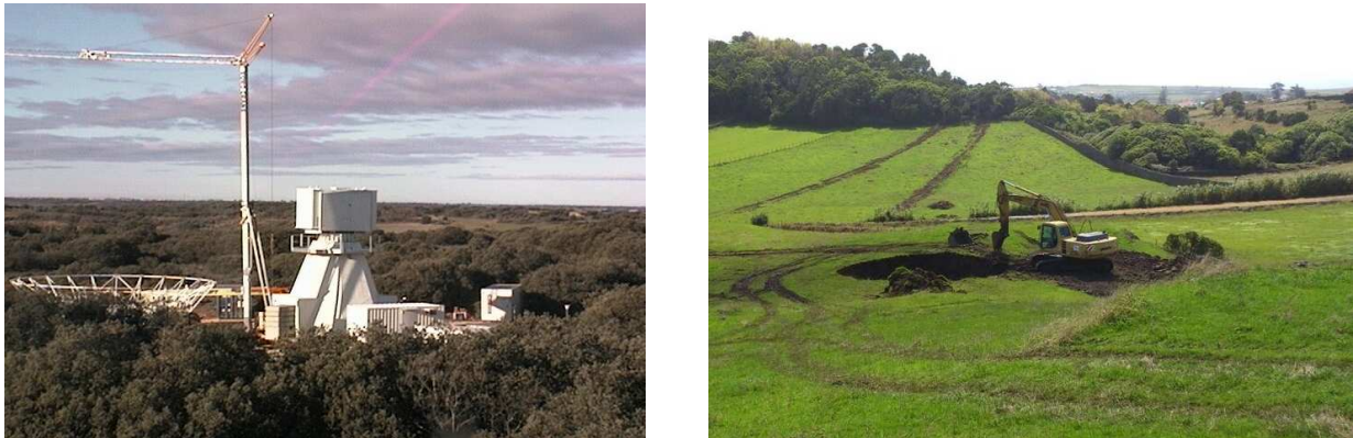
Figure 2. Left: RAEGE telescope under construction at Yebes. Lifting of the azimuth cabin. Right: Work for the RAEGE telescope in Santa María (Azores Islands).

IGN, together with its Portuguese colleagues in DSCIG (Azores Islands), continues the construction of a network of four new Fundamental Geodynamical and Space Stations. The RAEGE project has been described in previous IVS Annual Reports. The first antenna is being erected in Yebes (see Figure 2), and the construction of a tri-band (S/X/Ka) receiver and optics, developed at Yebes Labs, is also progressing. It is expected to be completed and to start operation in 2013. Activities have also started at RAEGE's Santa María site with the construction of the concrete tower and the infrastructure facilities. The assembly of the steel backstructure is anticipated for June 2013. On September 17, 2012, an official inauguration ceremony kicked off the start of construction. The event took place in the presence of local authorities as well as regional government representatives. The infrastructure project includes the construction of the main control building, a building for power distribution, a social facilities building (to be built in a second phase), and access roads. The Santa María site will include a completely isolated gravimetry pavilion, buried in a small hill, on top of which a permanent GNSS station will be installed.