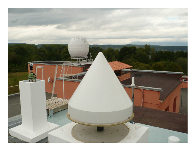
Figure 2. Javad GPS/GLONASS/Galileo receiver at Figure 3. "Sazhen-TM" SLR system at the Zethe Zelenchukskaya observatory.

The Javad GPS/GLONASS/Galileo receiver with meteo station WXT-510 is in operation (Figure 2). The SLR system "Sazhen-TM" (Figure 3) of the Zelenchukskaya observatory joined ILRS in March 2012. The technical characteristics of the system are presented in Table 3.