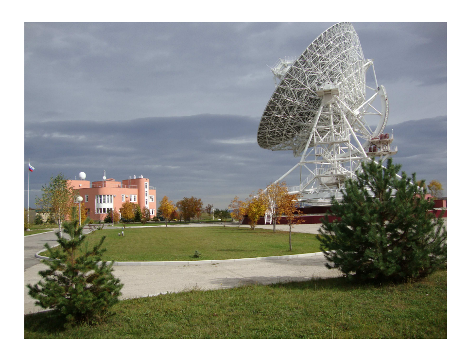
Figure 1. Zelenchukskaya observatory.

The sponsoring organization of the project is the Russian Academy of Sciences (RAS). The Zelenchukskaya Radio Astronomical Observatory is situated in Karachaevo-Cherkesskaya Republic (the North Caucasus) about 70 km south of Cherkessk, near Zelenchukskaya village (Table 1). The geographic location of the observatory is shown on the IAA RAS Website: <a href="http://www.ipa.nw.ru/PAGE/rusipa.htm">http://www.ipa.nw.ru/PAGE/rusipa.htm</a>. The main instruments of the observatory are the 32-m radio telescope equipped with special technical systems for VLBI observations, the SLR system, and the GPS/GLONASS/Galileo receivers.