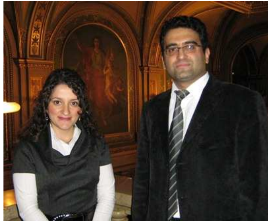
Figure 1. KTU-GEOD staff at Vienna State Opera.

The KTU-GEOD IVS Analysis Center (AC) is located at the Department of Geomatics Engineering, Karadeniz Technical University, Trabzon, Turkey.