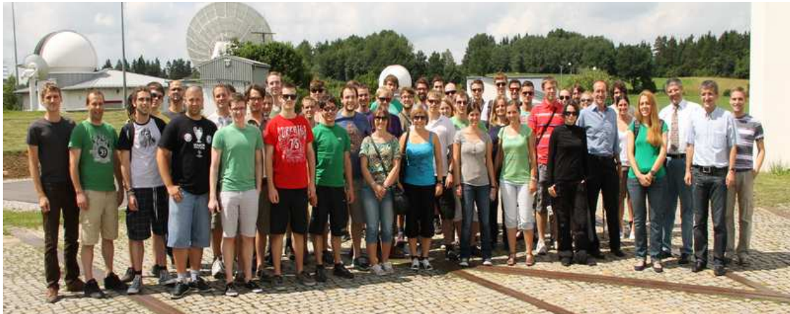
Figure 1. Excursion to Wetzell in June 2012 with staff members and students of the master course.

Since October 2012, we have been part of the Department of Geodesy and Geoinformation (GEO) in the Faculty of Mathematics and Geoinformation of the Vienna University of Technology. GEO is divided into seven research units, one of them focusing on advanced geodesy (mathematical and physical geodesy, space geodesy). Within this research unit, one group (out of three) is dealing with geodetic VLBI.