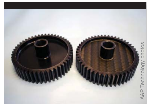
A&P Technology photos