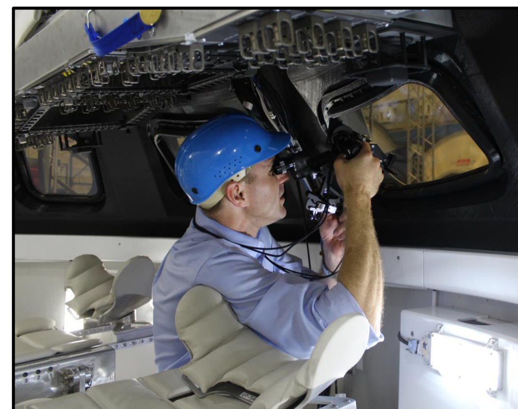
Effective Field-of-View Testing in Orion Mockup

This technology is applicable as an autonomous backup or confirming navigation source for any future human spaceflight mission.