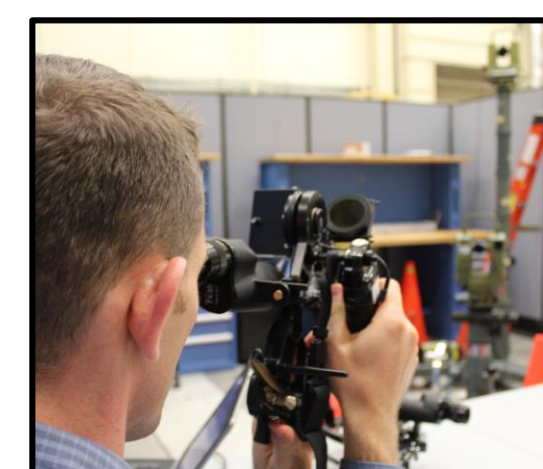
Laboratory Accuracy Tests