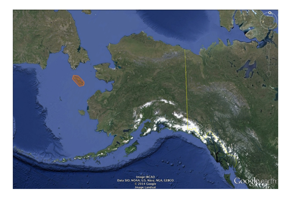
Figure B4. Turbulence forecast polygon over St. Lawrence Island redrawn in Google Earth.

Equipped with the information provided on the original forecast image and the approximated latlon values for the polygon, the weather polygon can now be described in the new ASN.1 schema. The information from the image that is relevant includes the issue (or forecast) time (1300 UTC Wednesday), valid start time (1200 UTC Wednesday), valid end time (0000 UTC Thursday), altitudes, and predicted turbulence intensity ("OCNL TO CONS MOD"). Based on the set of times here, the reference time in the TAIGA message header should be 1200 UTC because it is the earliest time to be referenced in the message. All three times for this payload (1200 UTC, 1300 UTC, and 0000UTC the next day) will all be described in 10-minute steps from the reference time (0, 6, and 72, respectively). Upon encoding this information using the XML encoding rules (XER), the following XML document is produced.