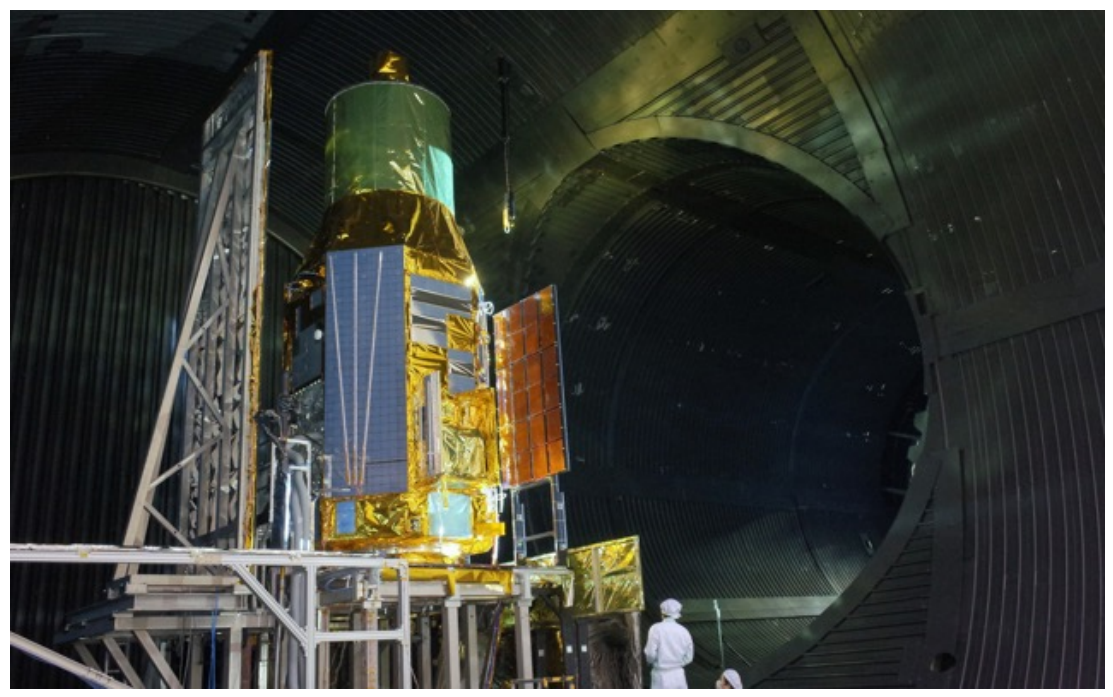
Figure 1.—Astro-H Satellite

The talks discussed the operation and thermodynamic performance of the ADR, the porous plug and helium dewar, and the cryocoolers. The system has been shown to meet all of its requirements (most importantly 50 mK detector operation and >90% observing efficiency) in both cryogen and cryogen-free modes. The Astro-H satellite is shown in Figure 1 just prior to thermal vacuum testing at the Tsukuba Space Center, Japan. The testing was successful, and now Astro-H moves on to final vibration and acoustic testing, before being shipped to the launch site at Tanagashima Space Center, Japan.