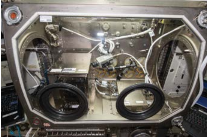
Figure 3: 3D printer installed in the MSG on the ISS.