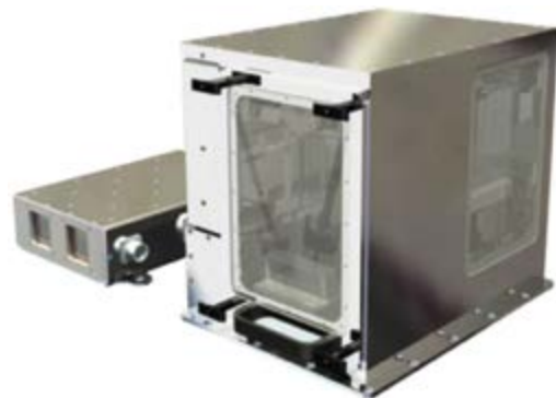
Figure 1: 3D printer unit.

The objectives of this technology demonstration project are to provide: (1) A detailed understanding of the critical design and operational parameters for the additive manufacturing process as affected by the microgravity environment, (2) the first demonstration of additive manufacturing in space, (3) a detailed analysis of how acrylonitrile butadiene styrene (ABS) thermoplastic resin behaves in microgravity versus Earth’s gravity, (4) a comparison between additive manufacturing in Earth’s gravity and in a consistent, long-term exposure to microgravity, and (5) the advancement of the TRL of additive manufacturing processes to provide risk reduction and capabilities to future flight or mission development programs.