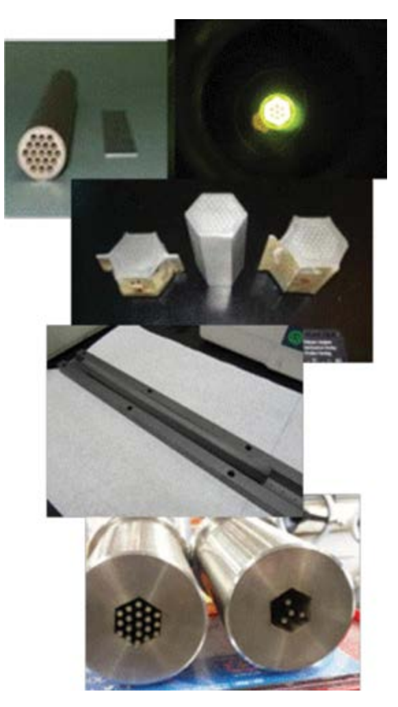
Figure 2: NTP fuel element fabrication.