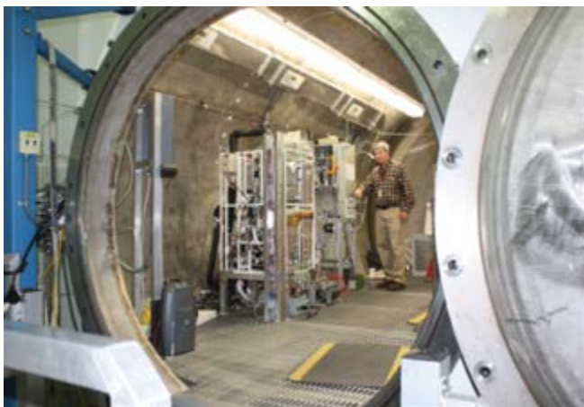
Integrated test chamber enables testing of AR technologies in an environment that simulates human metabolic activity integrated with functional AR hardware.