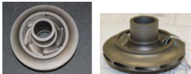
Figure 2. SLM Ti6-4 manufactured turbopump impeller.

Accomplishments for this task include the design of the impeller, SLM impeller, and material coupon fabrication, final machining (fig. 2), structured light scanning and inspection; spin burst testing, material strength data development, and data analysis. The spin test was successfully performed and operated up to 147,600 rpm, with the result that the impeller could not be failed with the equipment used.