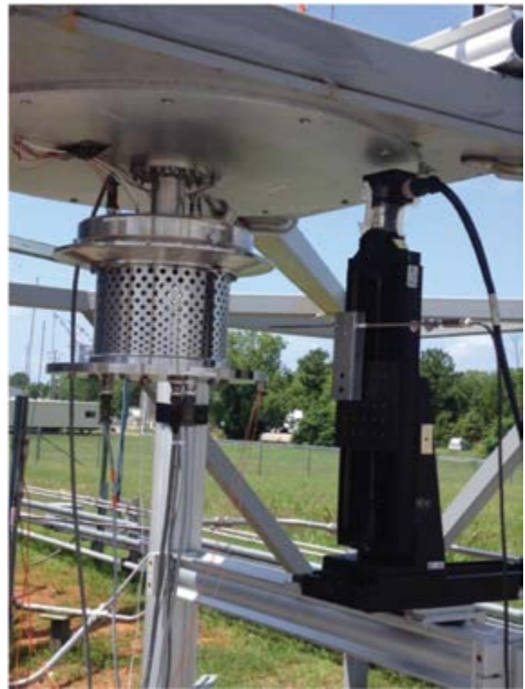
Low-profile diffuser being tested without wire-cloth attached in order to validate CFD model.

The purpose of the task was to create a diffuser design that had a lower vertical profile (in order to be able to raise the liquid surface) while still maintaining uniform flow.