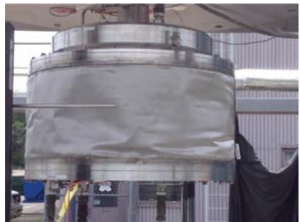
Low-profile diffuser being tested with wire-cloth attached using hot-wire anemometer to measure external velocity profiles.