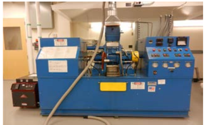
Rubber Lab mixer and control system.

The experimental design was composed of a logic path that performs iterative formulation and testing in order to maximize the effort. A lab mixing baseline was developed and documented for the Rubber Laboratory in Bldg. 4602/Room 1178.