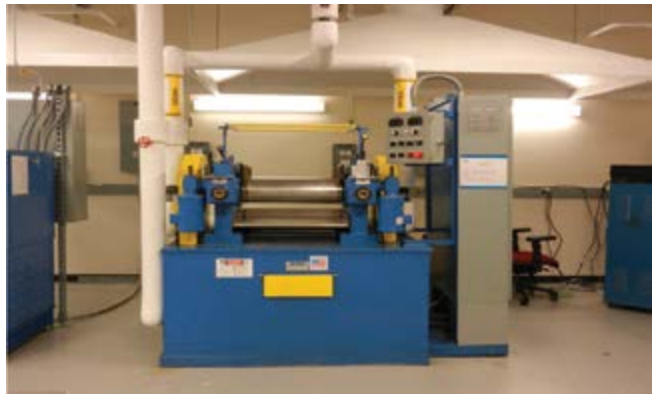
Rubber Lab mill and control system.