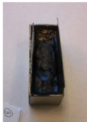
Lunar regolith sintered brick.

Series Bosch reaction, reacts hydrogen with \text{CO}_2 to produce recover oxygen by producing water.