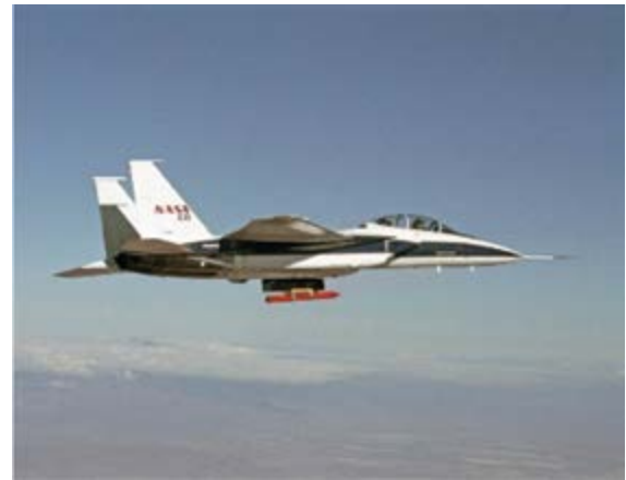
Figure 2: F-15 with the PFTF.