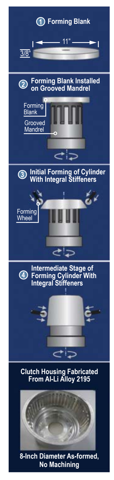
Integrally stiffened cylinder fabrication process.

Structural launch vehicle components, like cryogenic fuel tanks (e.g., space shuttle external tank), are currently fabricated via multipiece assembly of parts produced through subtractive manufacturing techniques. Stiffened structural panels are heavily machined from thick plate, which results in excessive scrap rates. Multipiece construction requires welds to assemble the structure, which increases the risk for defects and catastrophic failures.