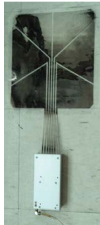
Actual electrostatic gripper (unmounted).