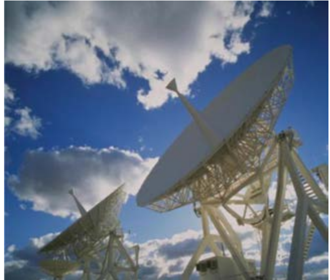
Ground station antennas.

With the explosion of the CubeSat, small sat, and nano-sat markets, the need for a robust, highly capable, yet affordable satellite base station, capable of telemetry capture and relay, is significant. The Programmable Ultra-Lightweight System Adaptable Radio (PULSAR) is NASA Marshall Space Flight Center's (MSFC's) software defined digital radio, developed with previous Technology Investment Programs and Technology Transfer Office resources. The current PULSAR will have achieved a Technology Readiness Level-6 by the end of FY 2014. The extensibility of the PULSAR will allow it to be adapted to perform the tasks of a mobile base station capable of commanding, receiving, and processing satellite, rover, or planetary probe data streams with an appropriate antenna.