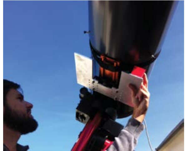
Figure 2: Star tracker mount on ALAMO telescope.

The project kickoff was completed in August 2014 and performance requirements have been defined. Prototype design is underway including electronics, optics, and software. A bracket has been designed and fabricated for mounting the prototype on the ALAMO telescope (fig. 2).