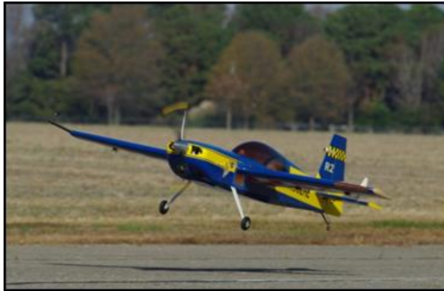
Figure 2. Edge 540 Vehicle