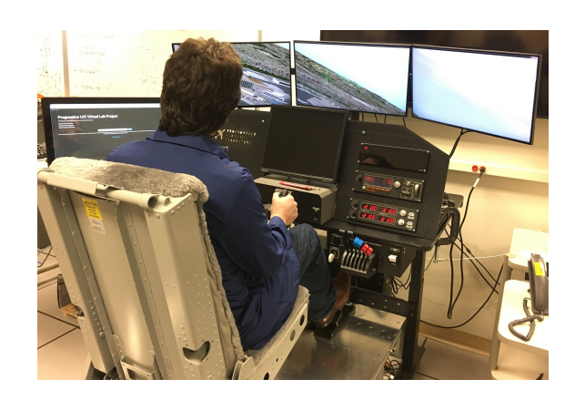
Figure 3. The Virtual Lab Pilot Station

In addition to these virtual aircraft modules custom virtual aircraft can be created using the clients.