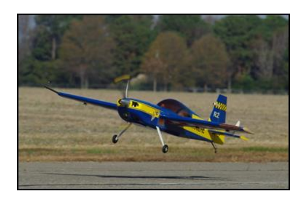
Figure 2. Edge 540 Vehicle

To enable these experiments the Prognostics Virtual Laboratory was designed around a modular framework utilizing gateway clients to connect different hardware/software to a network facilitating message publication and subscription. This network, the LVC Gateway, was developed at NASA by the Live Virtual Constructive Distributed Environment (LVC-DE) project. The project created the LVC Gateway to integrate key concepts, technologies and/or procedures in a relevant air traffic environment. <sup>4</sup> The LVC Gateway is a capable of connecting virtual manned, virtual unmanned, and real UAVs in the field from various centers into a single real-time virtual airspace and has been proven to be a powerful tool for training and research. <sup>5,6</sup>