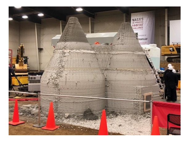
Figure 15. Penn State University's completed habitat.

Following habitat construction, habitats were subjected to three tests, shown in Figure 16: