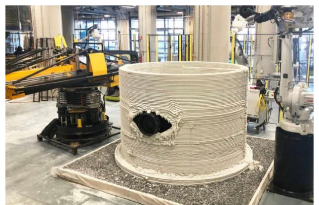
Figure 13. Habitat element printed by SEArch+/Apis Cor.

each level. Wall penetration elements designed by the teams were also placed autonomously. Teams were evaluated on the outcomes of the hydrostatic test, autonomy (penalties were imposed for interventions), accuracy of penetration placement, conformity (measurement of inner diameter of habitat element), and materials. Teams were required to submit new tests for material durability and compressive strength if their material formulation had changed from the previous construction level. The winner of this portion of the competition was also SEArch+/Apis Cor [20].