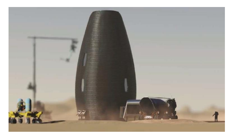
Figure 7. Image from AI Space Factory.

staging/preparation, workspaces, crew quarters, and exercise/recreation.