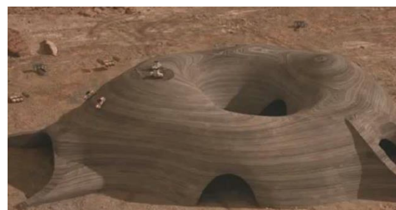
Figure 11. Image from Hassell + EOC.

Hassell + EOC's concept relies on a swarm of wheeled mining robots to excavate and collect regolith for processing into feedstock. Concurrent printing along the x-y footprint of the structure by the fleet of robots enables rapid and efficient fabrication. The resulting Mars habitat has a contoured structure intended to complement the surrounding environment.