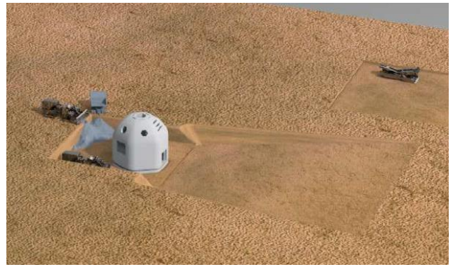
Figure 10. Image from X-Arc.

In the X-Arc habitat concept, materials for feedstock are extracted from the planetary surface via excavating robots. Polyethylene can be readily manufactured on the Martian surface, which has an atmosphere of approximately 95% CO2 and water available. Ground basalt is added to the polyethylene and extruded into feedstock from a gantry-style 3D printer. The habitat concept is a printed shell structure with 3 levels. Prefabricated components are placed inside the habitat and as penetrations via robotic assistance.