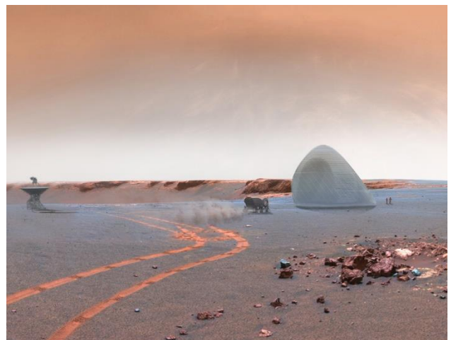
Figure 1. Mars Ice House. Image credit Space Exploration Architecture and Clouds AO.

The overarching goal of the 3D Printed Habitat Challenge is the advancement of additive construction technology to create sustainable housing solutions for Earth and space. The first phase of the challenge in 2015 asked teams to develop state of the art architectural concepts which take advantage of the unique capabilities offered by 3D printing. The winner of this phase of the challenge was the Mars Ice House from SEArch+ (Space Exploration Architecture) and Clouds AO (Figure 1). The design, which was further explored by NASA Langley Research Center, mined water present in the northern regions of Mars to create a shell of ice covering a deployed lander habitat, which also provides radiation protection for human inhabitants [7].