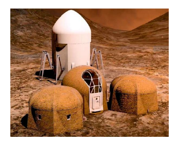
Figure 5. Image from Team Zopherus

Mars Incubator (3<sup>rd</sup> place) presented a series of habitats arranged in a hub and spoke design, with the largest, primary volume at the center. Panels in the design consist of polyethylene and basalt fiber. The habitat in this design is not fabricated via continuous additive manufacturing; instead, additively manufactured panels are mechanically assembled via robotic manipulation. Environmental control and life support systems (ECLSS) and mechanical, electrical, and plumbing (MEP) systems are located below the habitat modules.