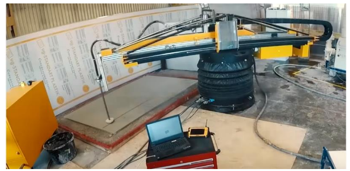
Figure 12. SEARch+/Apis Cor foundation print.

In level 1 of the construction competition (completed in July 2018), teams printed a foundation measuring 2 meters by 3 meters with a 100 mm slab thickness was printed on a 100 mm thick sub-base of #57 stone. A portion of the foundation was evaluated for flatness and levelness per American Concrete Institute (ACI) 117 [17]. Foundation durability was assessed with an impact test (performance scored on degree of cracking and material deformation) and by subjecting rectangular specimens to freeze/thaw testing per ASTM C666 [18]. Material strength was evaluated using a cylindrical compression specimen tested per ASTM C39 (this standard and test was also used in the Phase 2 competition). The winner of the level 1 construction competition was SEArch+/Apis Cor [19]. The print of their foundation is shown in Figure 12.