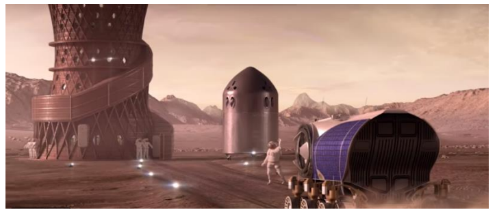
Figure 4. Image from SEArch+/Apis Cor

SEArch+/Apis Cor (1<sup>st</sup> place) proposed a vertical habitat design. The habitat is an inward facing arch design (a hyperboloid) with two layers. High density polyethylene (a polymeric material with good properties for radiation shielding) functions as the inner layer, while the exterior is regolith. Radiation shielding is accomplished via overhangs.