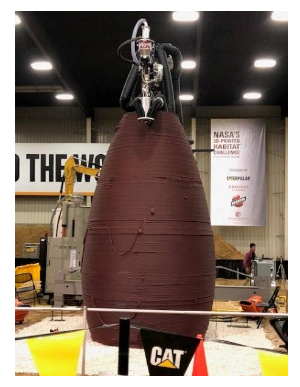
Figure 14. AI Space Factory's MARSHA habitat at the onsite competition.

construction of the team's vertically oriented habitat: MARSHA (Figure 14). PSU used a metakaolin based geopolymer concrete mortar material extruded through a nozzle on the end of an industrial robot arm. A second industrial robot was used to facilitate placement of penetrations (Figure 15).