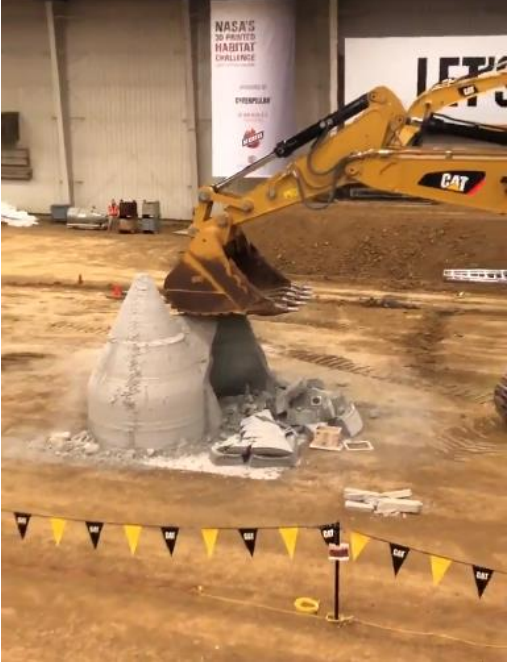
Figure 16. Onsite tests of printed habitats (top to bottom): smoke test, impact test, and crush test.