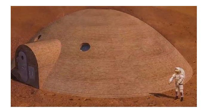
Figure 9.

In the X-Arc habitat concept, materials for feedstock are extracted from the planetary surface via excavating robots. Polyethylene can be readily manufactured on the Martian surface, which has an atmosphere of approximately 95% CO2 and water available. Ground basalt is added to the polyethylene and extruded into feedstock from a gantry-style 3D printer. The habitat concept is a printed shell structure with 3 levels. Prefabricated components are placed inside the habitat and as penetrations via robotic assistance.