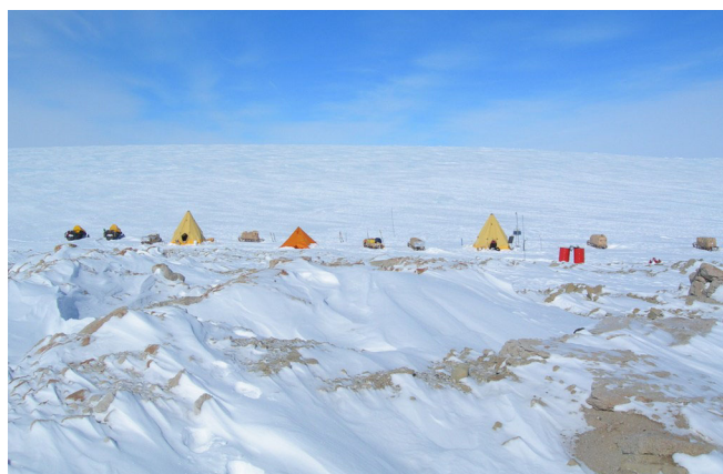
The reconnaissance team's DeWitt camp in the Taylor Valley region, their third camp of the season.

In a nutshell, it was a year marked by odd weather and low recovery numbers. While it certainly wasn't our plan to recover only a fifth of the typical haul of recent years, we worked hard and dealt with the conditions as best we could. I'm sure there are a few rocks in the 05 collection that will interest you. Certainly we're happy to let the curators at JSC and the Smithsonian catch their breath just a bit after several seasons of 1200+ recoveries.