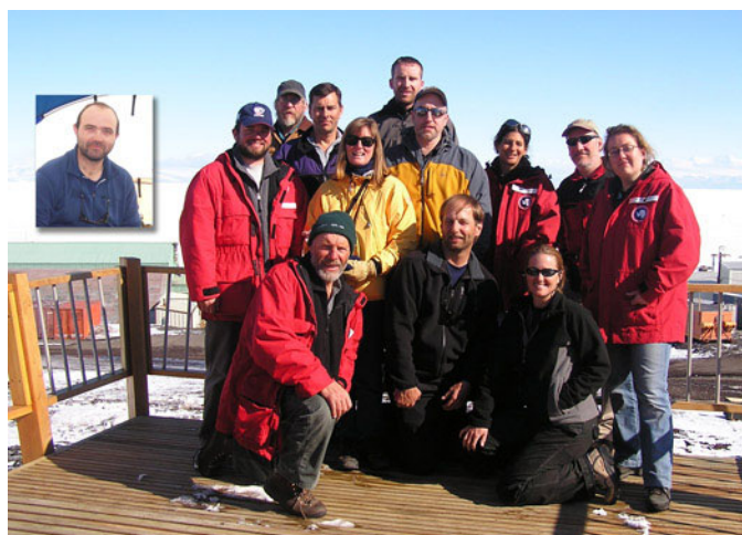
2005-2006 ANSMET field teams:

The 2005-2006 ANSMET field season went like clockwork but was a lean one for meteorites - only 171 for the systematic searching team in the Miller Range and 67 for the reconnaissance group exploring several blue ice patches south