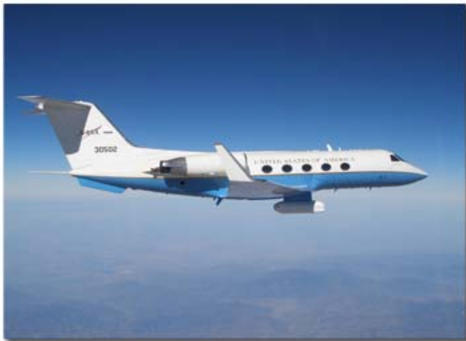
Figure 6: NASA's Gulfstream G-III Aircraft with UAVSAR Mounted Underneath.