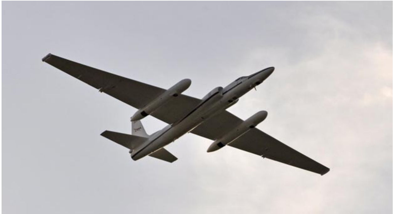
Figure 5: NASA's Earth Resources-2 (ER-2) Aircraft Carrying the AVIRIS Sensor.