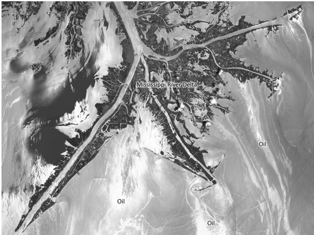
Figure 4: ASTER Image Showing Oil Slick Approaching the Mississippi River Delta in Southeastern Louisiana on May 24, 2010. Oil Appears as White Sheen. Annotation by NASA DEVELOP.