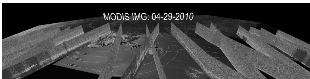
Figure 2 –Still Frame from DEVELOP's CALIPSO CALIOP Visualization. CALIOP Data Tracks are Overlaid on a Background MODIS Image.