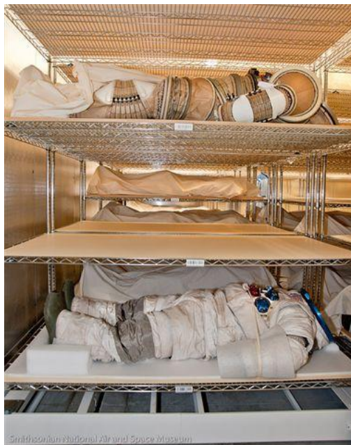
Figure 1. The Stephen F. Udvar-Hazy Center