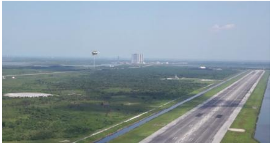
Morpheus rises above the KSC SLF during FF13

A post-test data review followed two to three days after each flight test. A folder was created in SharePoint for each flight test, and the team uploaded post-processed data plots, as-run procedures, and any presentations or files to explain test results. The SE&I team also managed a SharePoint list of key test parameters to be able to easily compare flight-to-flight performance.