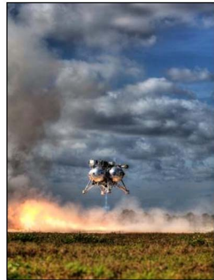
Morpheus liftoff over a flame trench at the KSC SLF

The Morpheus Project was not required to comply with NASA Procedural Requirements (NPR) 7120.5, "NASA Space Flight Program and Project Management Handbook," or NPR 7123.1, "System Engineering Procedural Requirements." However, both documents were used as bases for defining streamlined systems engineering products and processes early and throughout the project. In order to hold the line on lean development, project management guidance to SE&I was simply that "all processes had to buy their way onto the project." Any effort, tool or process that would consume team members' time had to demonstrate value with a short and easy learning curve.