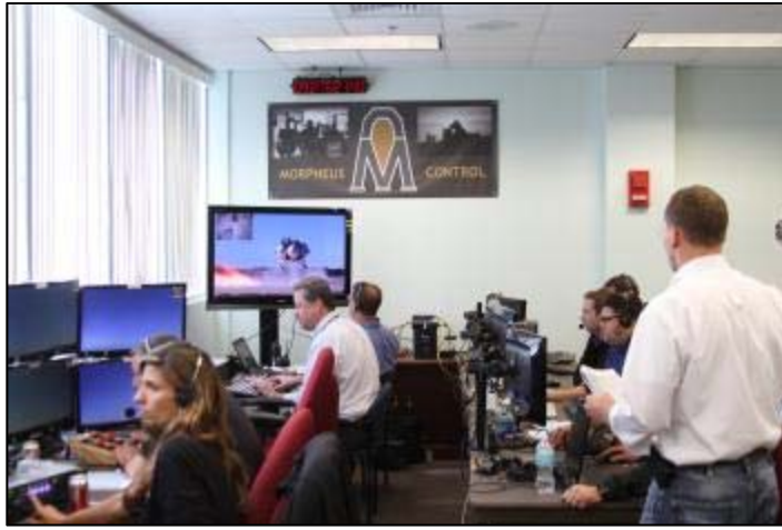
Morpheus Control at KSC during FF4

The project flight test approach provided the means to reduce risk incrementally, using static hot fires, tether testing, and free flight envelope expansion before stepping up to the maximum 245 m altitude by 800 m downrange flight trajectory.