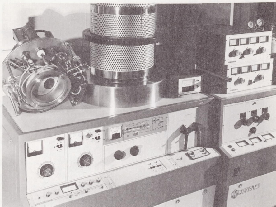
Vacuum System Used for Experimental Investigation

At higher temperatures (and pressures not lower than 10^{-6} torr), the device continues to give good response through 400^{\circ}\text{C} . Above this temperature, decomposition sets in as shown by both the weight loss and detector performance data.