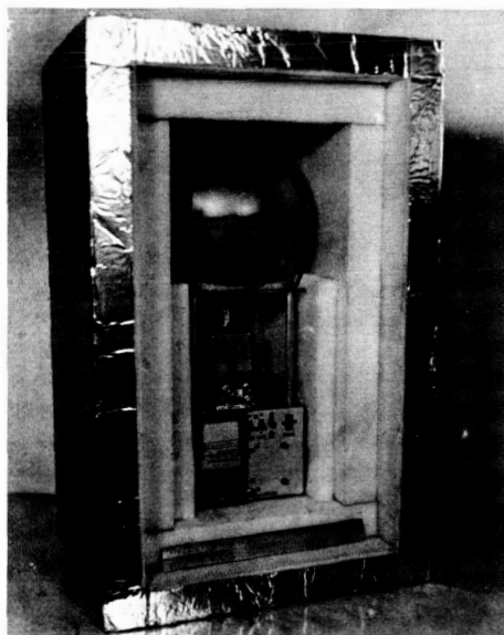
Figure 1. HASL pressurized argon ionization chamber mounted in balloon flight case.