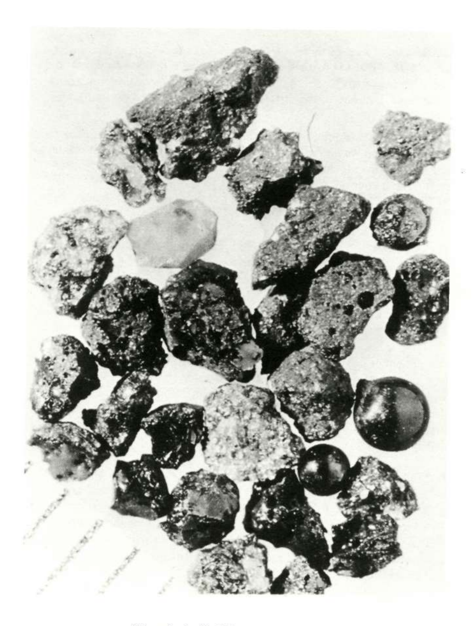
Figure 3-Apollo 11 lunar soil sampling.