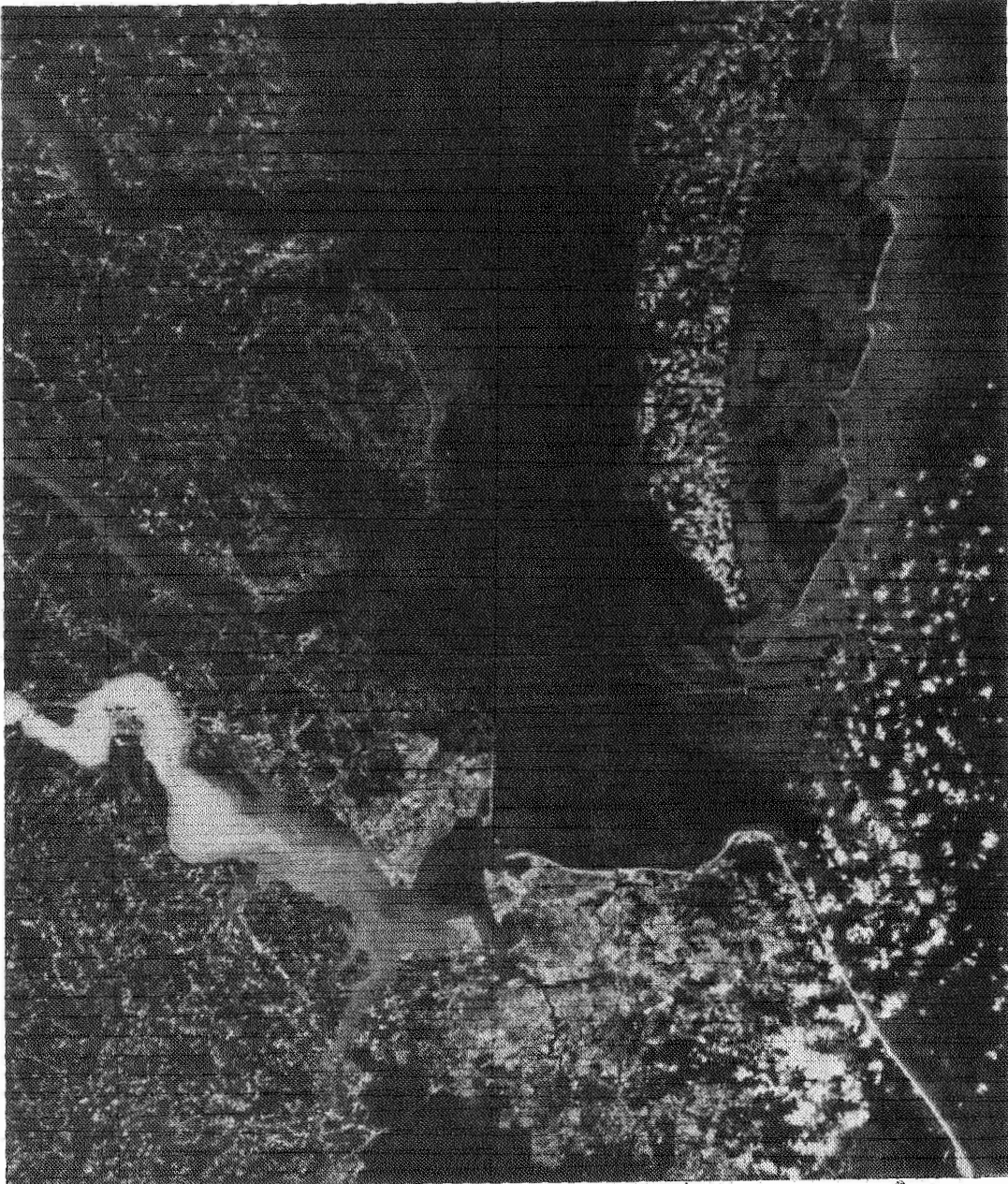
FIGURE 5 MSS Band 5. October 10, 1972. Chesapeake Bay Entrance