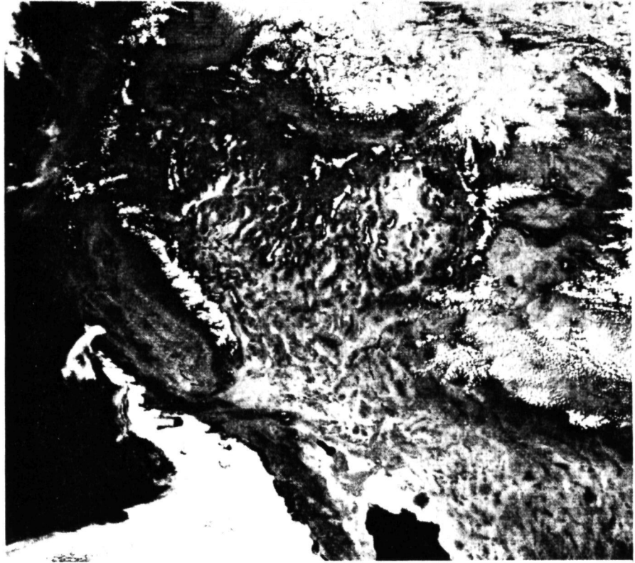
FIGURE 1 - HALF MILE VISUAL SECTOR FROM SMS-2

↑ 21:45 25MY75 32A-H 02131 18811 SA38N115W