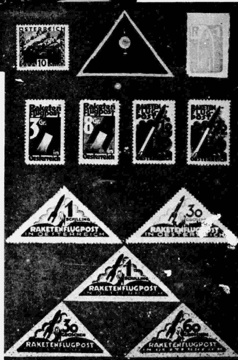
Fig. 2 Postal Stamps Used for the Rocket Mail