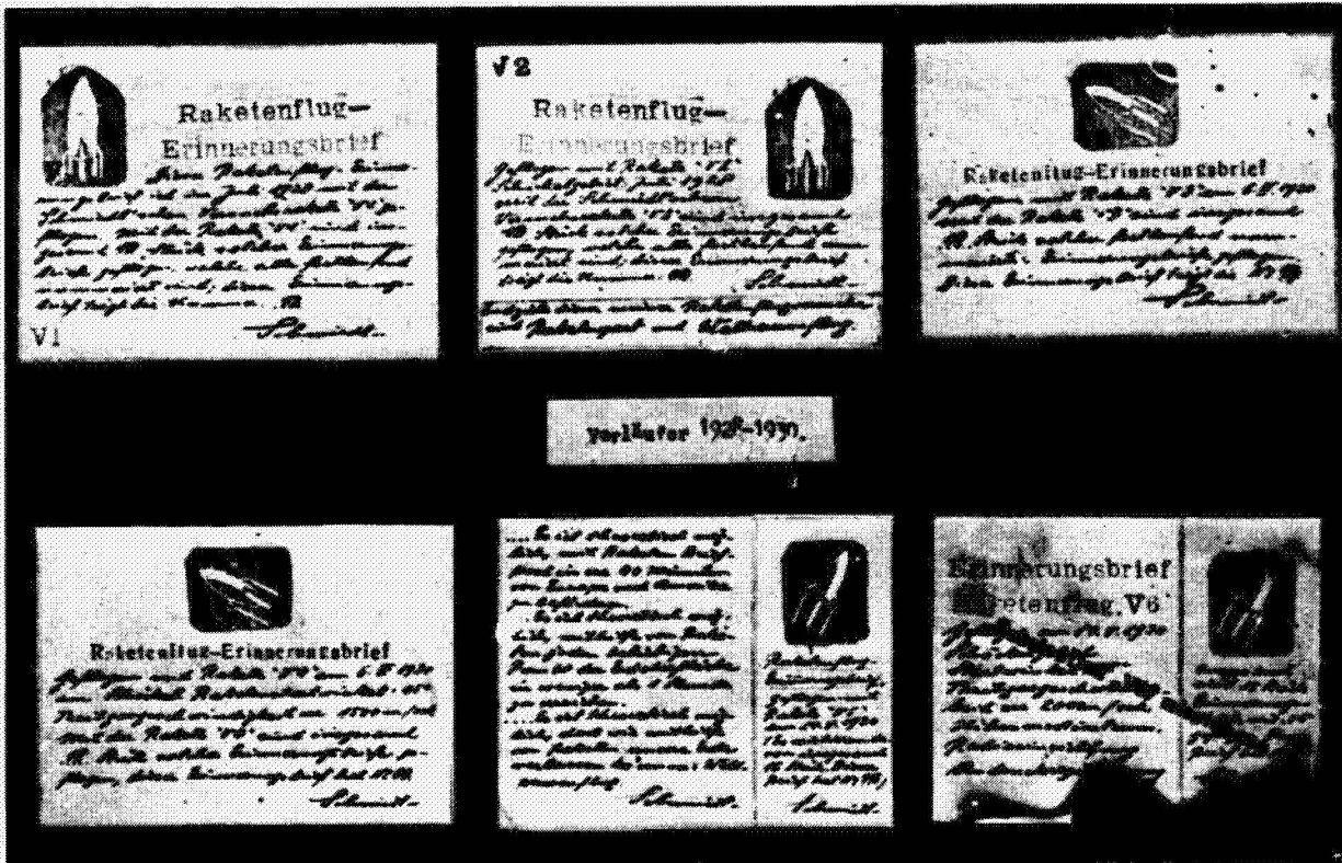
Fig. 3 Sample of Mail Posted Between 1928-1930

success I hoped to draw public attention to my experiments and locate someone to support my plans for further research: the construction of a rocket capable of crossing the English Channel (I started preliminary tests in 1932) and, as for the dream of my life, the construction of a space rocket. Such efforts were way beyond my personal financial means, requiring at least three wagon loads of solid fuel which, I am still convinced, is best suitable for space.