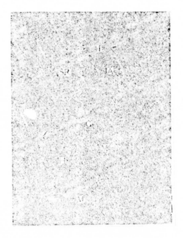
Figure 2: Electron micrograph of human muscle tissue.

Bundles of myofibrils arranged in order like banboo grooves. There are several bands of different sizes traversing each myofibril. They are the I-band consisting of Z-lines, and the A-band consisting of H-lines and M-lines.