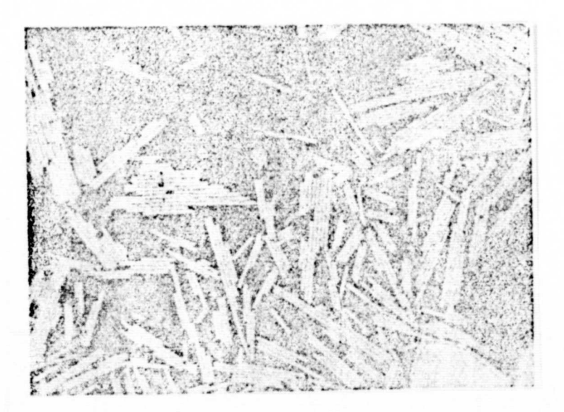
Figure 3: The electron micrograph of tomato virus (magnif., 35000 X)

The rods shown in this picture, which are of different length but the same radius, are tomato virus molecules. A black line can be vaguely seen at the center of the rod, which indicates that the com-. position of the central part is different from that of the other parts. Stripes can be seen vaguely on the rod, which suggests the orderly arrangement of biomacromolecules in the virus.