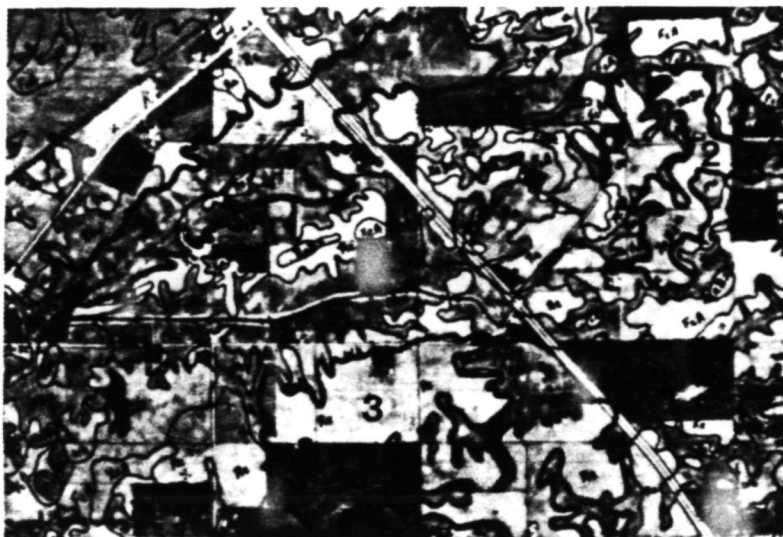
FIGURE 1. CONVENTIONAL SOIL MAP INDICATING THE (1) MAHALAVILLE, (2) XENIA, AND (3) REESVILLE MAPPING UNITS.